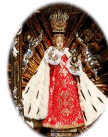
INFANT JESUS OF PRAGUE