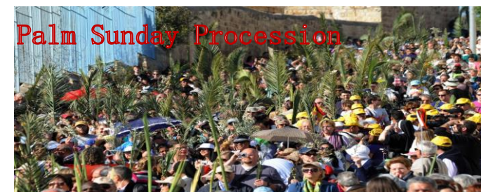
Palm Sunday Procession

Amman, Petra, Tiberias, Nazareth, Sea of Galilee, Cana, Capernaum, Haifa, Mount Carmel, Jaffa, Jerusalem, Bethlehem, Dead Sea, St. Catherine, Mount Sinai, Giza, Cairo Extension: Nile Cruise