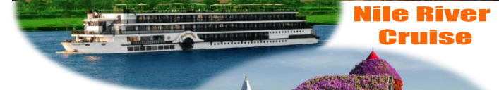
Nile River Cruise