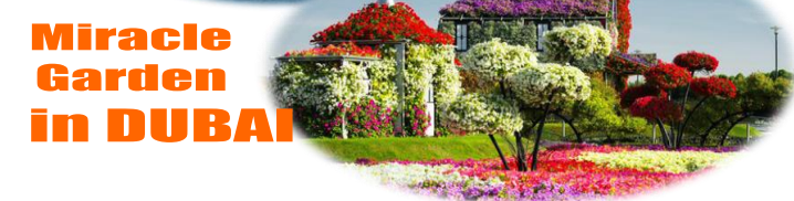
Miracle Garden in DUBAI

Amman, Petra, Tiberias, Nazareth, Sea of Galilee, Cana, Capernaum, Haifa, Mount Carmel, Jaffa, Jerusalem, Bethlehem, Dead Sea, St. Catherine, Mount Sinai, Giza, Cairo Extension: Nile Cruise & Extension: DUBAI