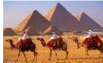
(Old 7th Wonder of the World) (New 7th Wonder of the World)