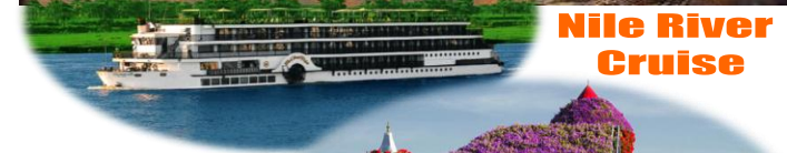
Nile River Cruise