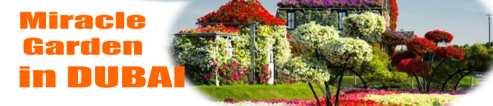
Miracle Garden in DUBAI

Amman, Petra, Tiberias, Nazareu, Sea of Galilee, Cana, Capernaum, Haifa, Mount Carmel, Jaffa, Jerusalem, Bethlehem, Dead Sea, St. Catherine, Mount Sinai, Giza, Cairo Extension: Nile Cruise & Extension: DUBAI